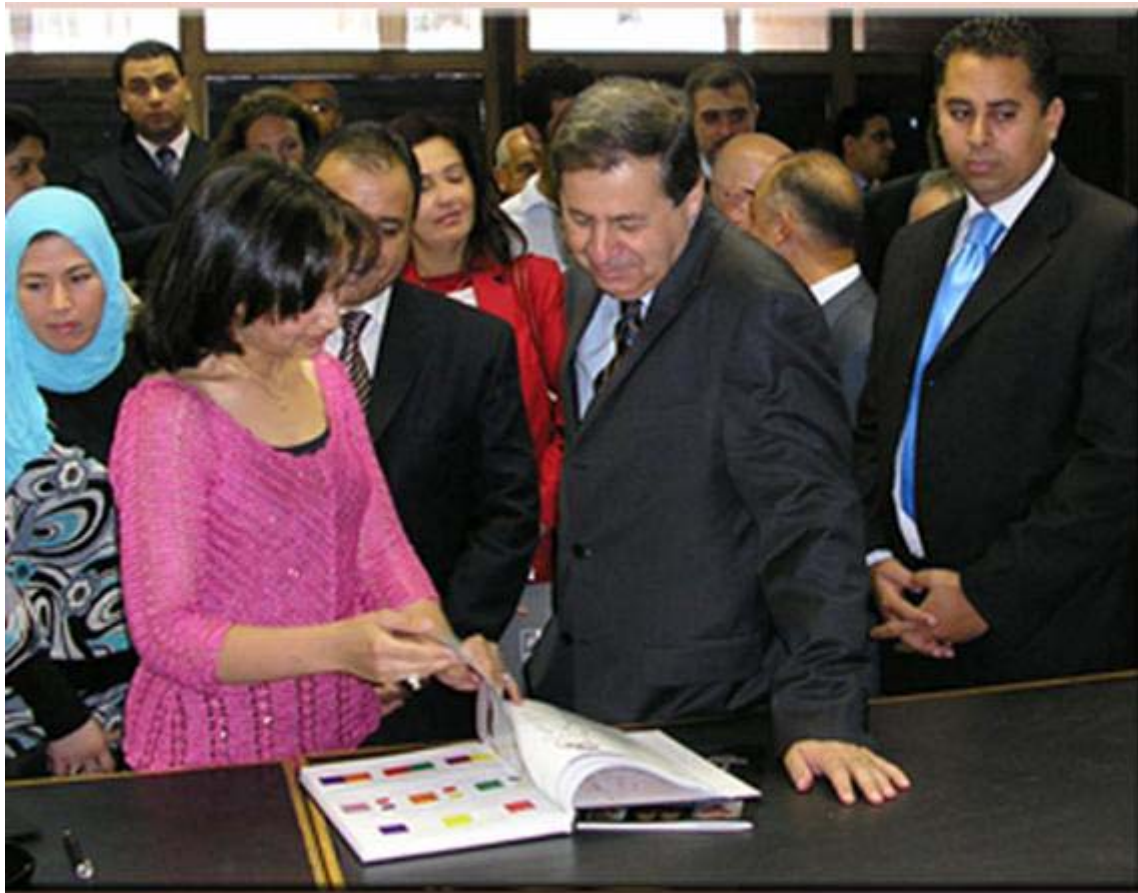
Eng. Rachid M. Rachid Minister of Trade and Industry